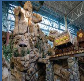
Moose Mountain Adventure Mini-Golf