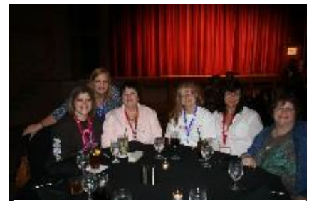
Social Event Dinner

The online application went live on October 31 st and the computer based exam became available at Prometric Testing Centers across the country on November 14 th . The exam fee is $215 and payable by credit card (only) through the application process. Approved candidates will have 90 days from the date of their approval to test email to take the exam. The details of eligibility as well as an outline of the test specification can be found in the Candidate Handbook . Work on the PCC Exam Study Guide continues. Please direct any questions about the PCC Exam to pcce@paralegals.org .