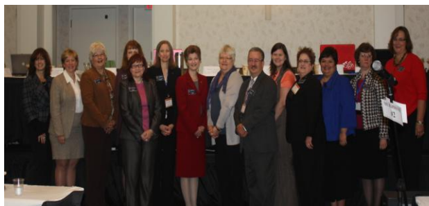
The New Board